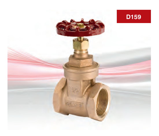
Please note: the photograph & dimensional drawing denotes sizes 1/2" - 2" only.